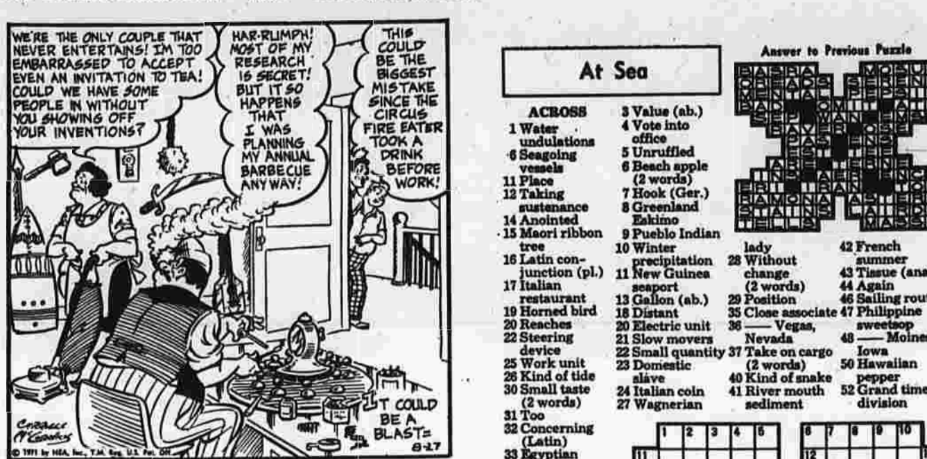
OUN BOARDING HOUSE with MAJOR HOOPLE