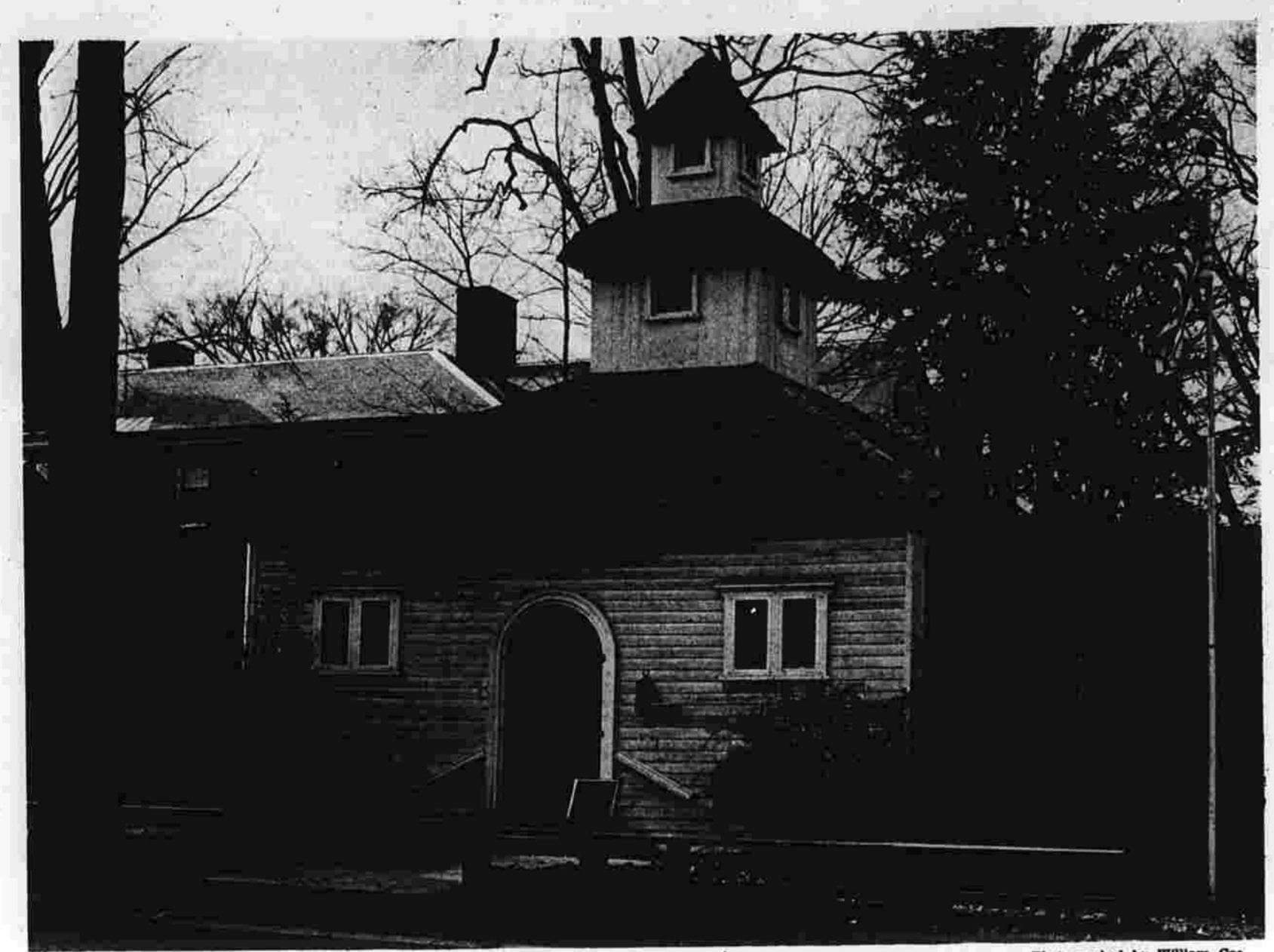
POST OFFICE, OLD DEERFIELD, DESIGNED AFTER MEETING HOUSE

WASHINGTON — This column is dedicated to the proposition that at least one part of President Nixon's dramatic program — repeal of the 7 per cent auto excise tax — may be great economics but is nonetheless very poor public policy.