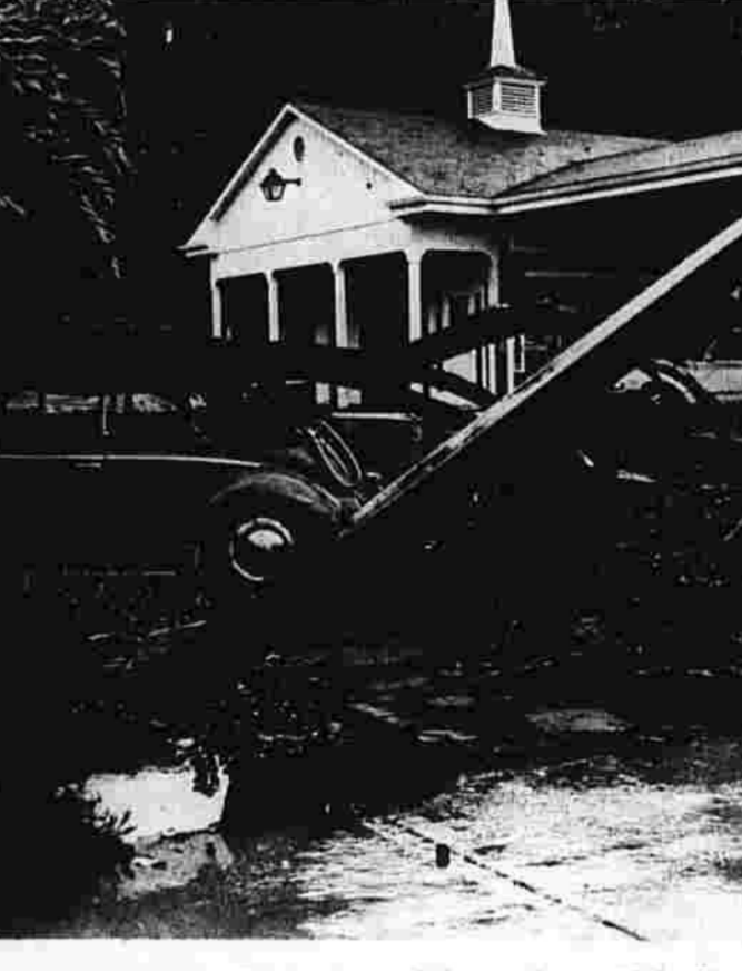
Winds from tropical storm Doria downed decorative light pole and sent tree limb crashing on convertible Volkswagens at the ARCO Service Station at 706 Main St. about 7 this morning.

Winds from tropical storm Doria downed decorative light pole and sent tree limb crashing on convertible Volkswagens at the ARCO Service Station at 706 Main St. about 7 this morning. The scene was typical of dozens of storm-related incidents throughout Manchester at the height of the storm.