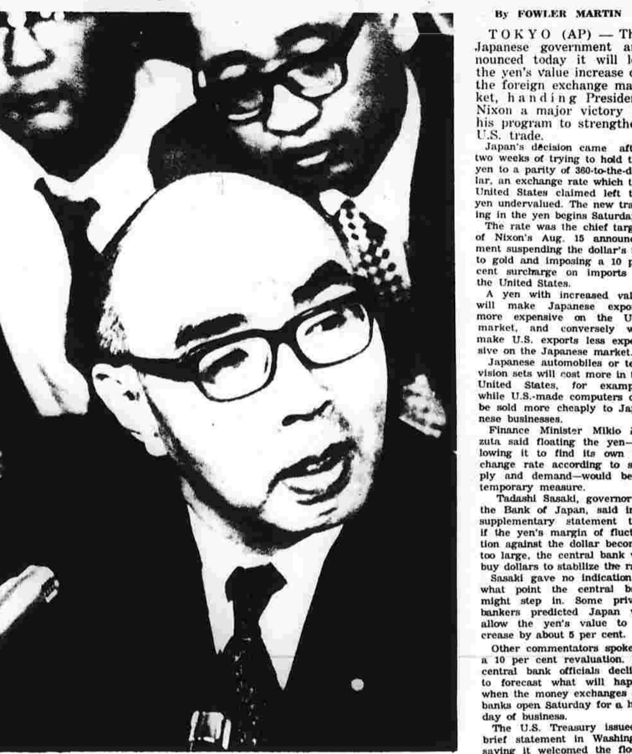
Japanese Finance Minister Mizuta announces plan to float yen.