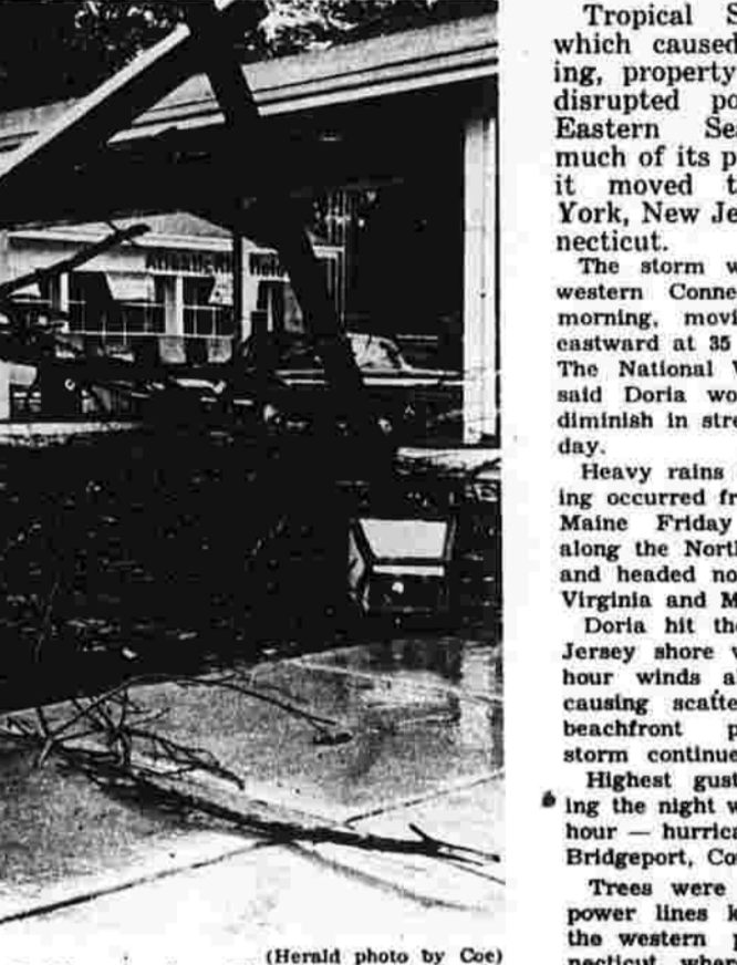
Heavy rains and some flooding occurred from Maryland to Maine Friday as it moved along the North Carolina coast and headed northward through Virginia and Maryland.

Heavy rains and some flooding occurred from Maryland to Maine Friday as it moved along the North Carolina coast and headed northward through Virginia and Maryland. Doria hit the southern New Jersey shore with 150 mph winds about 3:30 a.m., causing scattered damage to beachfront properties.